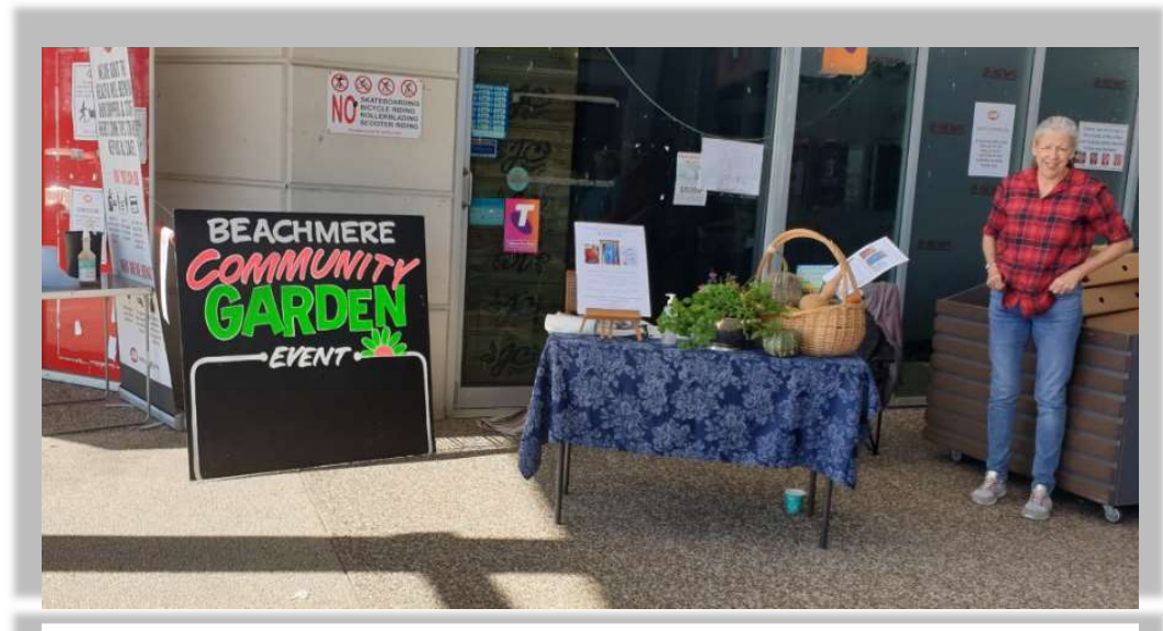
NIKI OUT THE FRONT OF IGA WITH THE BCGI RAFFLE TABLE.

https://www.moretonbay.qld.gov.au/Council/Meetings/2021/23-June-2021-General-Meeting/Video-Stream