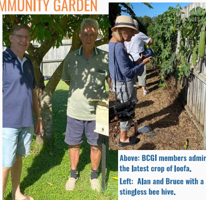
Above: BCGI members admire the latest crop of loofa.

Thanks again for the invite and we look forward to visiting the garden for our Neighbour Day celebration on the 11th June (Postponed from 14th May).